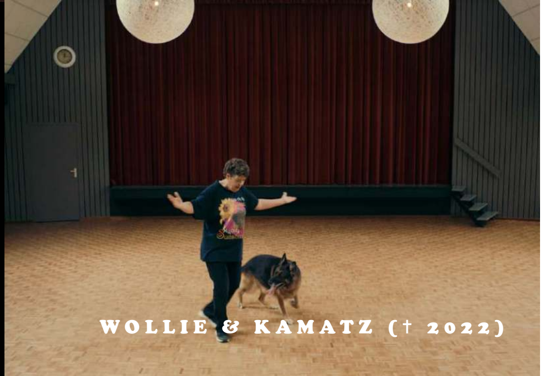
WOLLIE & KAMATZ (+ 2022)